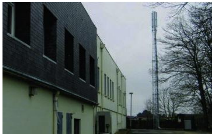
The Orange phone mast and antennas.