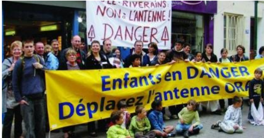
4 May 2009: Demonstration in front of the Orange shop in the pedestrian zone of Château-Thierry.