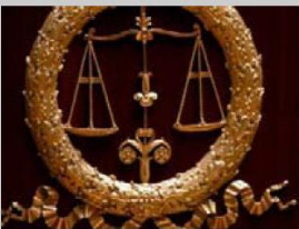
Crown Court of Nanterre JUDGEMENT

Crown Court of Nanterre (TGI) - France : Citizens living near phone masts vs. Bouygues Telecom.